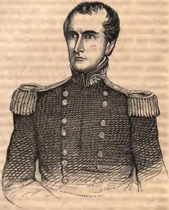
GENL. JOHN E. WOOL.